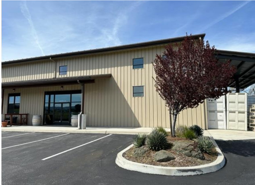
Suite D – Main Entry

3,498 SqFt Space Available in December 2023