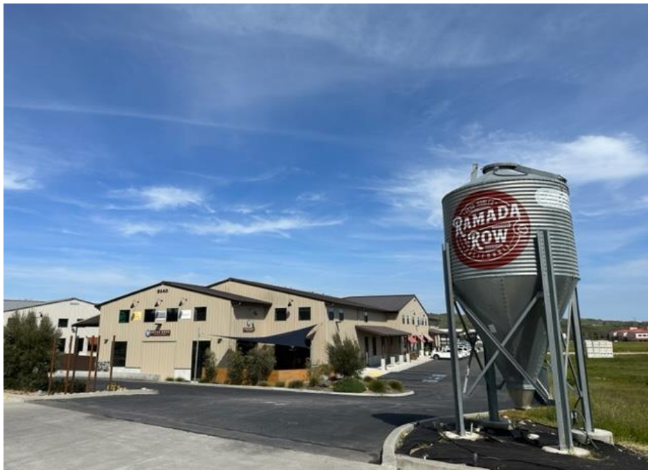
Ramada Drive Entrance with 101-Freeway Visible Signage and Landmark