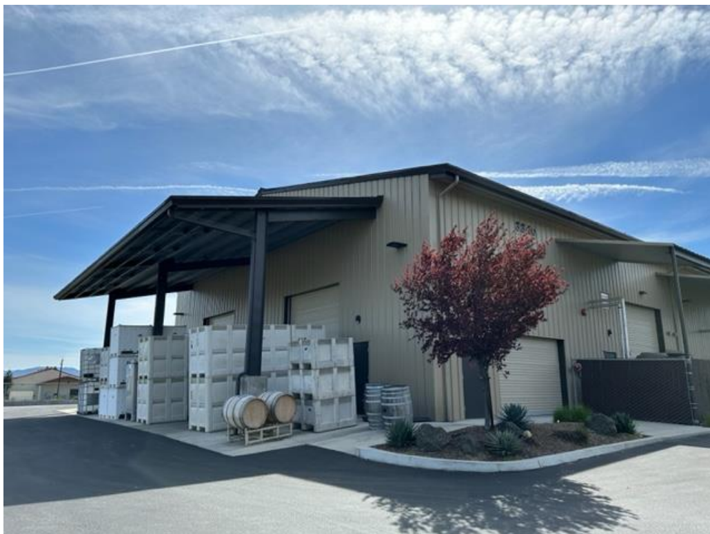
Storage Area with 2 Roll Up Doors and Adjacent Warehouse Entry