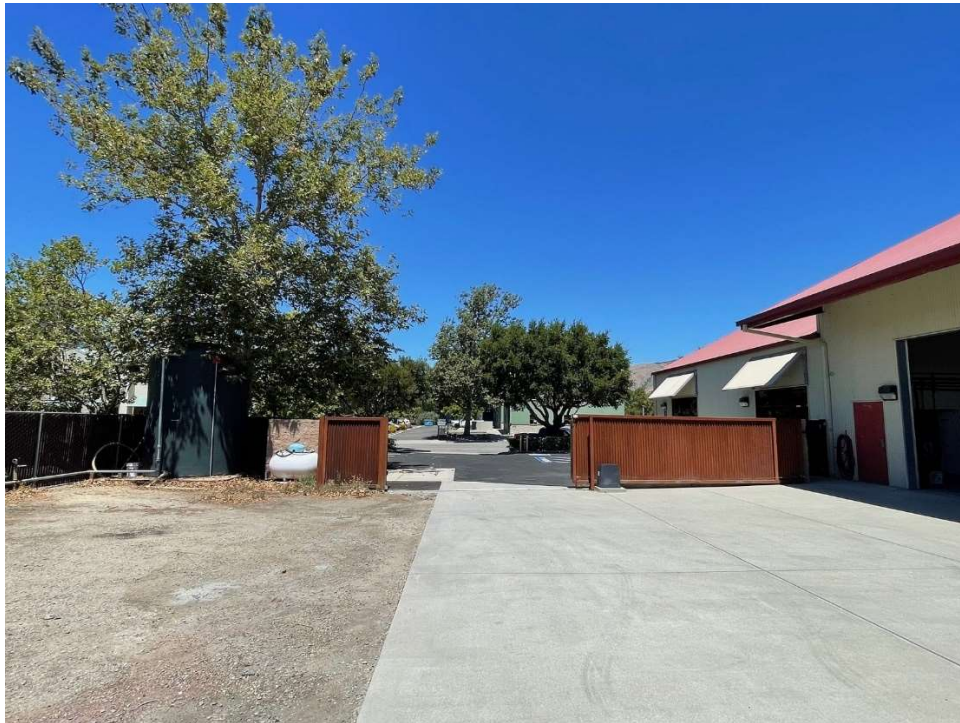
Secured Yard Area – Keypad Access