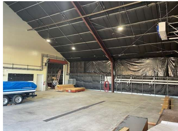
Infrastructure: Glycol Cooling System, Floor Drains, Waste Management System