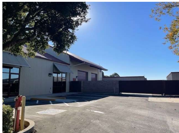
Main Entrance into Office/Reception Area