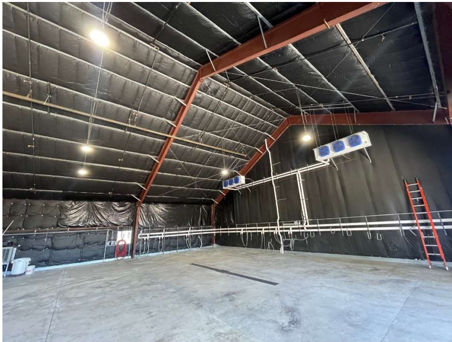
High Volume Open Warehouse Space (22+ ft)