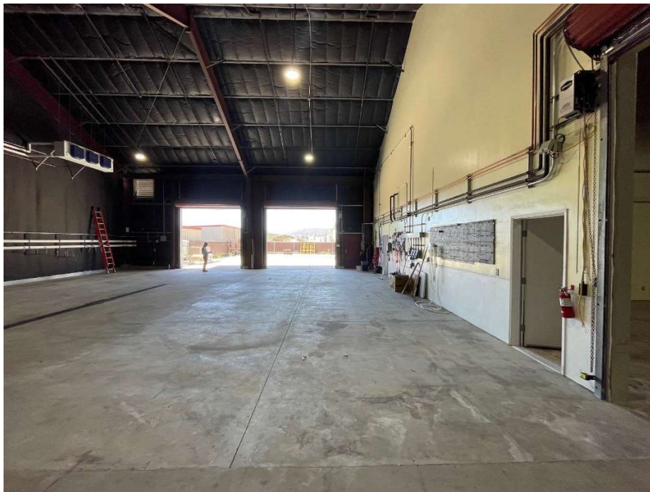
View from Backside of Warehouse – Facing the Fenced Yard Area