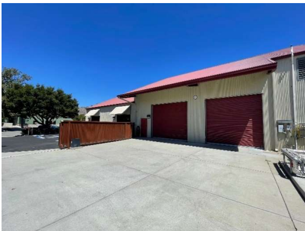
Entrance into Warehouse