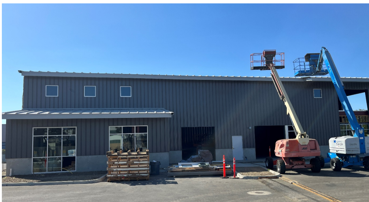
Construction Progress facing Steel Way