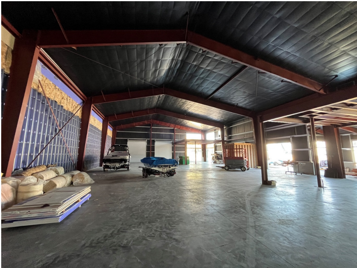
Construction Progress Inside Warehouse