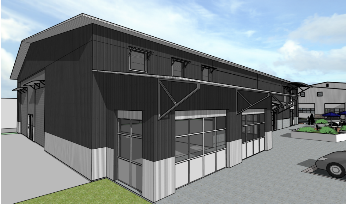
Rendering of Warehouse Entry