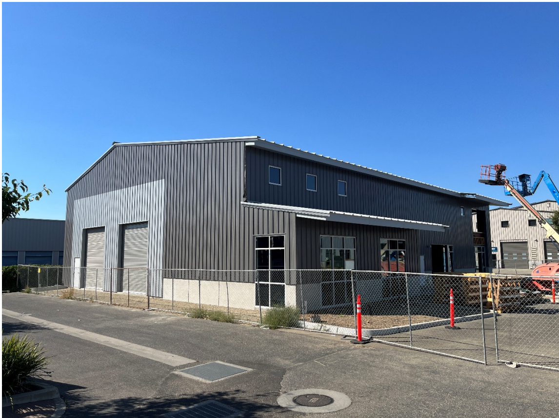
Construction Progress Warehouse Entry