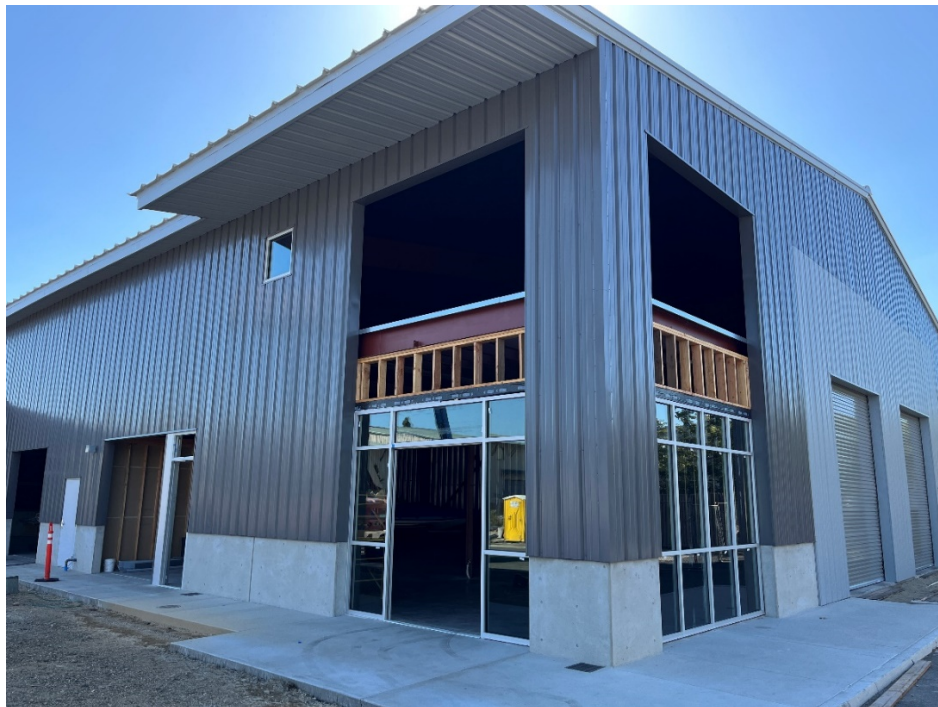
Construction Progress on Main Building Entry