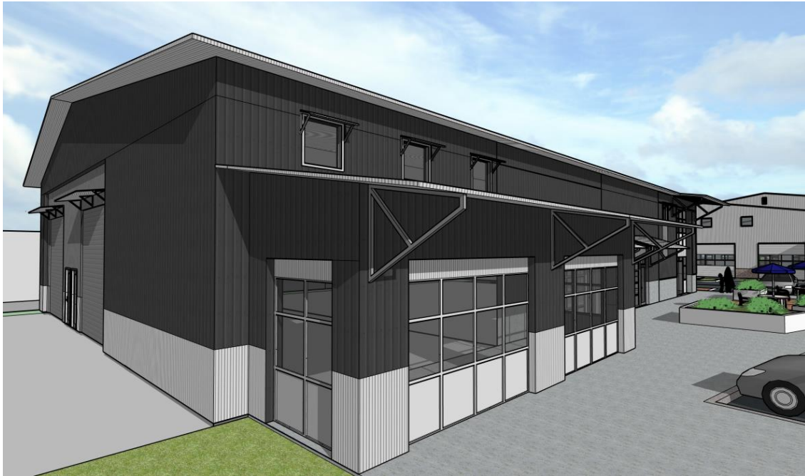
Rendering of Warehouse Entry