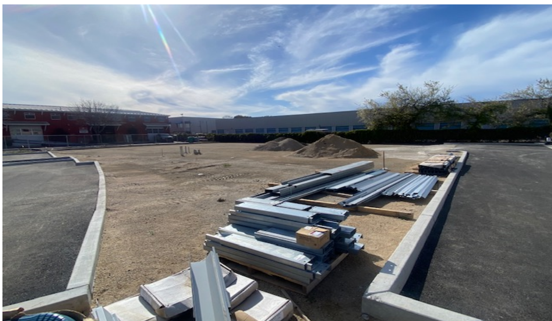
Building Pad ready for footings