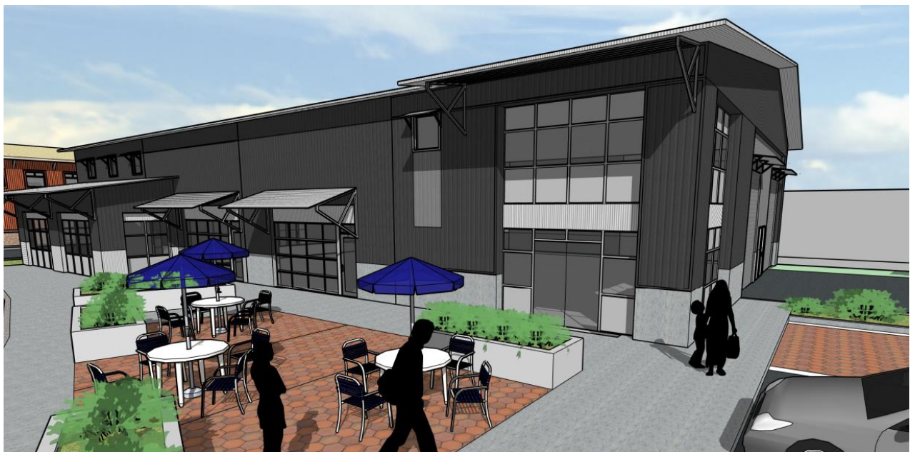
Rendering at Main Entry

New 9,197 SqFt Solar-Powered Building Available 2024