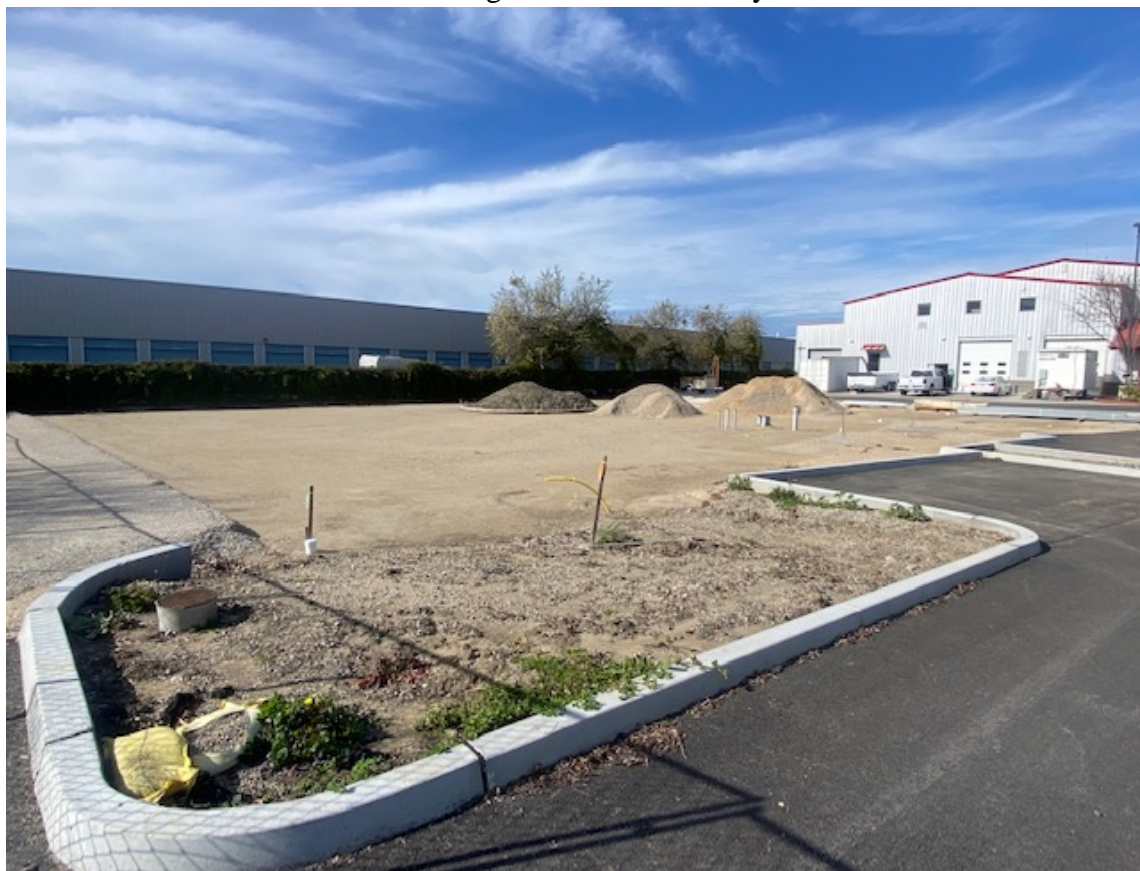
Building Pad with parking lot installed