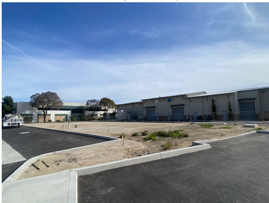
Building Pad ready for footings