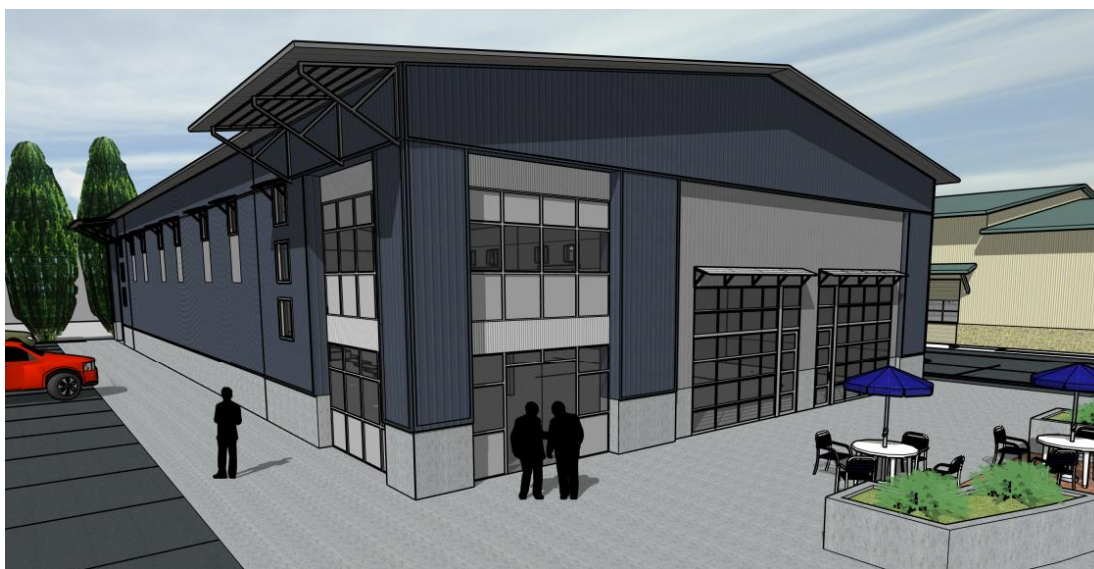
Rendering at Main Entry

New 10,688 SqFt Solar-Powered Building Available 2024