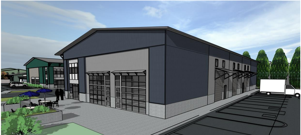
Rendering of Warehouse Entry