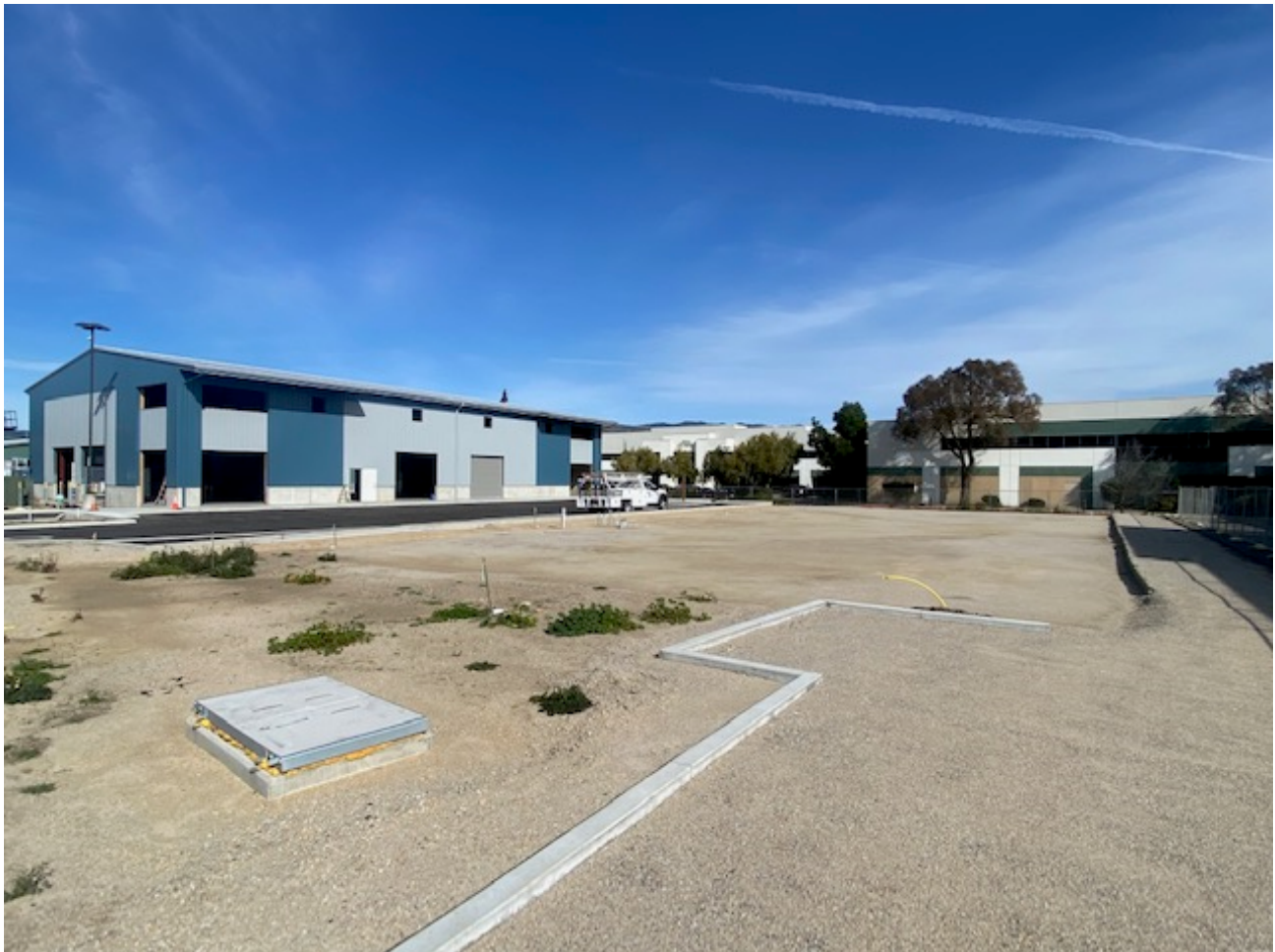
Building Pad with parking lot installed